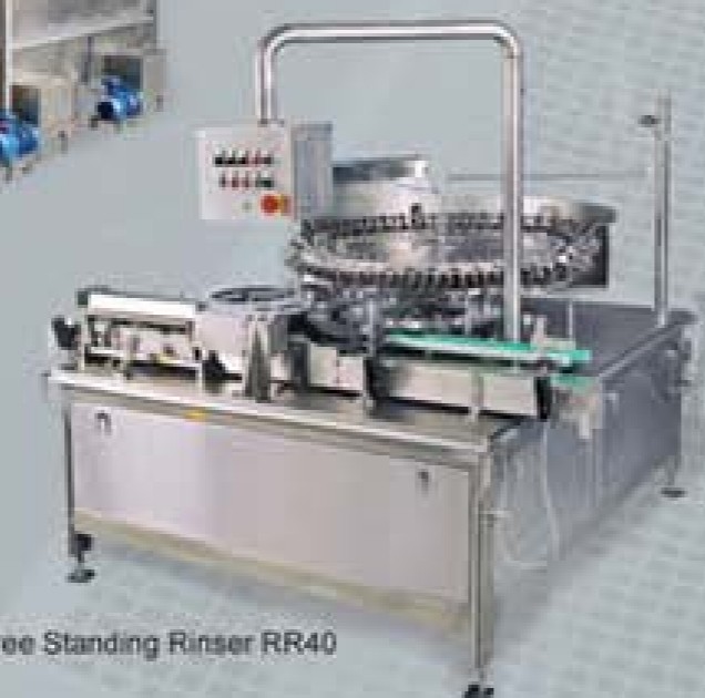
Free Standing Rinser RR40

Isobaric fillers P-RFC are designed for filling carbonated beverages into PET and glass bottles. The cycle of operation of machines includes rinsing, filling and capping/crowning. Size range 24 to 96 filling valves with capacity up to 900 bottles (0,5L) per minute.