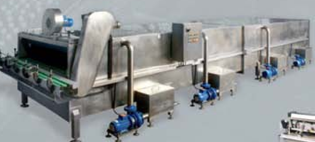
Cooling Tunnel CT-23